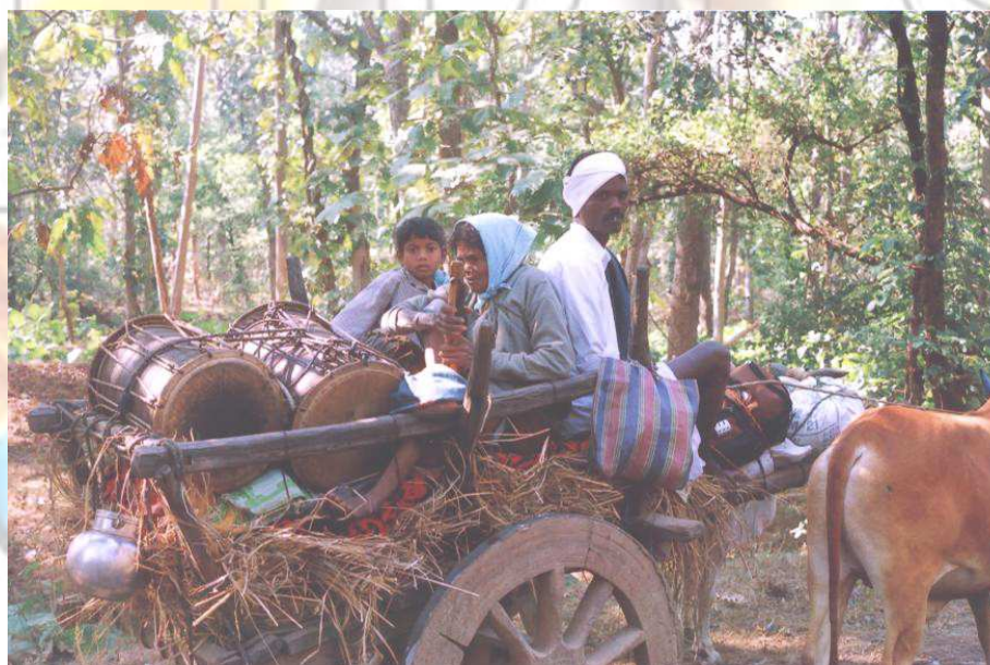
Fig. 2: Typical Gond family